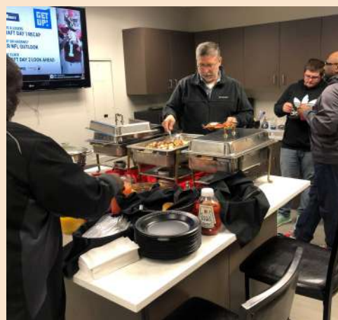
Thank you, MBP!